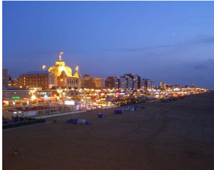
Scheveningen Beach, five minutes from where I live

That would be the hardest part, though; we had a really vibrant social life at home and had a really hard time leaving all our family and friends behind, but thanks to Facebook, we still feel connected and love being able to share our adventures with everyone back home and still keep in touch with what they're doing!