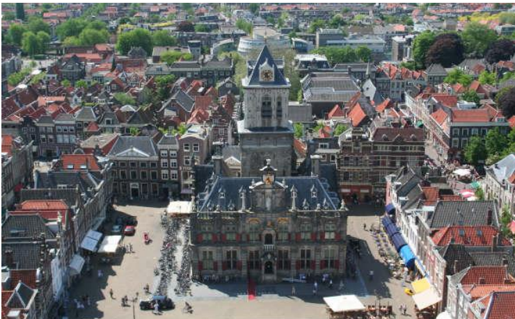
building in Delft, very close by to the Hague

The real fun has been exploring this gorgeous city! The Hague is close to the North Sea; we live in Scheveningen, which is right on the beach. The area we are in is so green, full of parks, trees, and tons of different kinds of birds. It's perfect for outdoorsy people like us who don't like living in a city. We walk most everywhere or take public transit; my bus ride to work is exactly 7 minutes long, and the buses and trams usually come every 15 minutes. Most people here travel by bike; lots of people have cars, but when you consider the reliability of public transit, the availability of space to park your car, and the ridiculously high price of gas, that option is less attractive. We crunched the numbers, and the amount we spent at home to run two vehicles dwarfs the amount we expect to spend on public transit while living here, so that's been an eye-opener, although here it is far easier to get away with not having a vehicle.