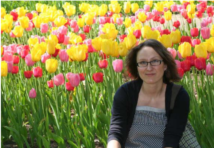
Me at Keukenhof, the spring flower festival

Moving is a pretty big job. It's an even bigger job when your move isn't down the street, but to another continent altogether. My husband and I had the chance to see a dream come true when I got a job as a scopist (working my way up to writer) at the International Criminal Tribunal for the former Yugoslavia in The Hague, Netherlands. We had been dreaming of a big adventure together before we settled down into a mortgage and kids, so this was perfect for us. Then came the job of packing up our lives and starting a new one, a job that is still ongoing.